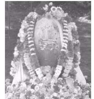
Sambodh Aranya Shiva