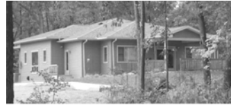
Sambodh Center for Human Excellence

In the quiet woodlands of Kalamazoo, MI, Sambodh Center for Human Excellence (SCHE) is quietly emerging as a major facility in the United States for the teaching of Vedanta, Meditation, Ayurveda and Yoga fostered by the Dharmic vision: the unity of all, and the unity of all spiritual paths. SCHE serves as the headquarters of The Sambodh Society, Inc. and is maintained by devotees, donors and friends.