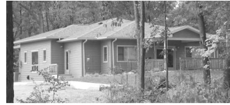
Sambodh Center for Human Excellence